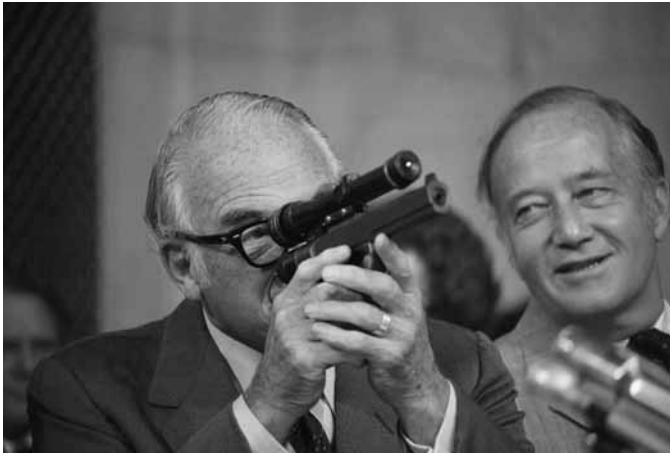
Senator Goldwater examines CIA dart gun as Senator Charles “Mac” Mathias (R-MD) looks on.